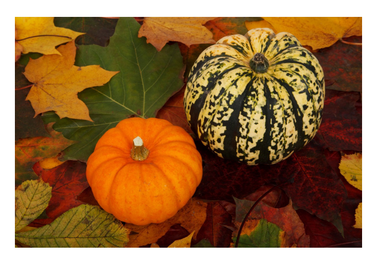
To plant a garden is to believe In tomorrow. Audrey Hepburn