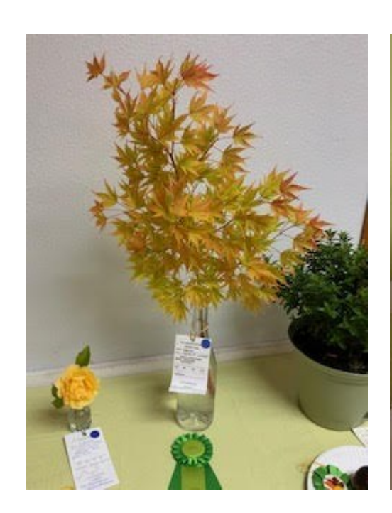
Cindy Swanberg Root & Bloom