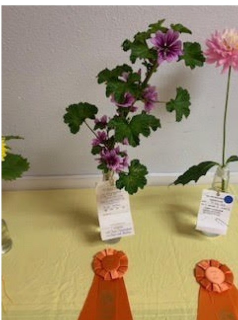
Sue Thompson Root & Blooms