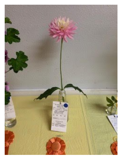
Cindy Swanberg Root & Bloom