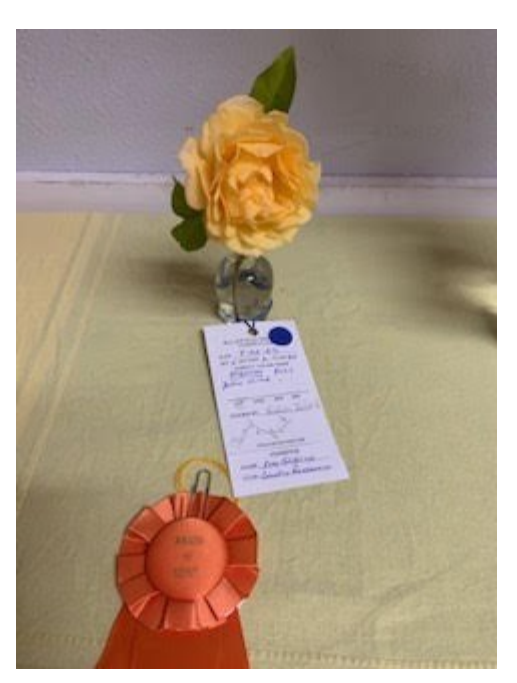
Roxie Giddings Country Gardeners