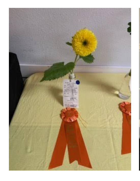
Cindy Swanberg Root & Bloom